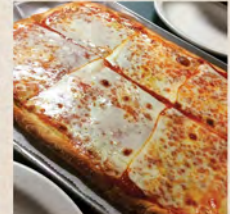
EXTRA CHEESE SQUARE PIZZA