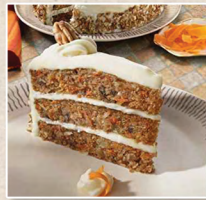
Carrot Cake 8.99