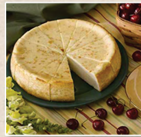
NY Style Cheesecake 7.99