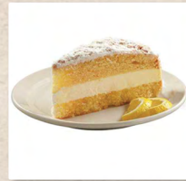
Lemon Italian Cream Cake 8.99