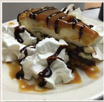
Turtle Cheesecake 9.25