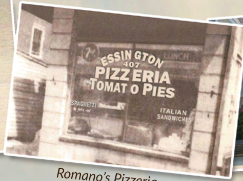
Romano's Pizzeria Circa 1944