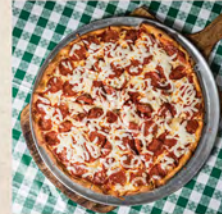
TRADITIONAL ROUND PIZZA

sm round 14.99 med round 18.99 lg round 23.99 md square 19.99 lg square 26.99