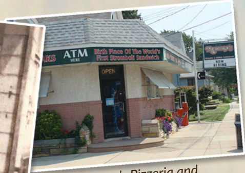
Romano's Pizzeria and Italian Restaurant Today