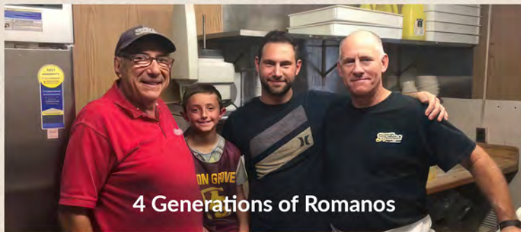
4 Generations of Romanos